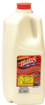
Plains 1/2 Gallon